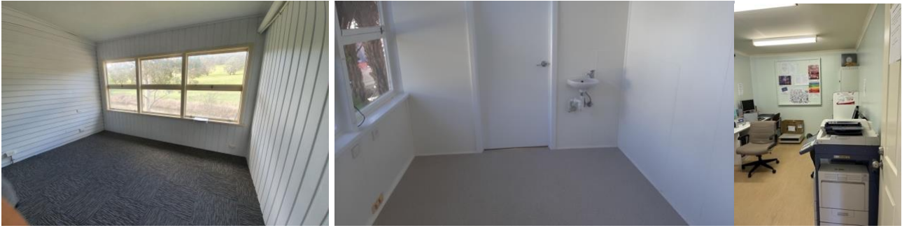
Figure 2 - Photos showing the existing facilities at Tubbut (Left), Goongerah (Middle) and Bendoc (Right) – pending final renovations and furnishing.