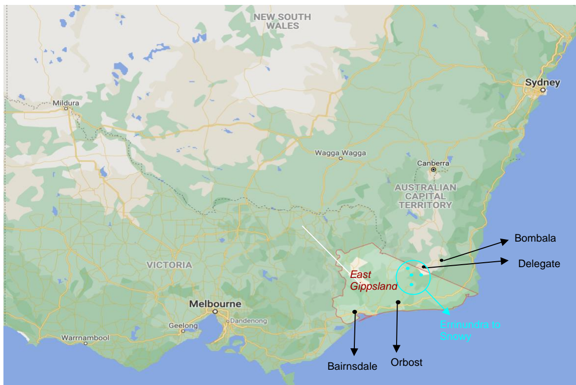
Figure 1 - Map of Southeast Australia showing East Gippsland and the location of the Errinundra to Snowy district and proposed Wellbeing Spaces.

Access to services has been reducing over time and paired with long road closures and power outages during emergency events, has become the core issue affecting the district. Orbost Regional Health (ORH) is the closest Victorian health service and has a role providing services to the area. Accessing the NSW health services across the border has been a stop-gap in the past, however these services are declining and at risk. More recently, an outreach service to the district from Orbost has been funded, mostly through short-term (12 month) mental health funding allocations. Due to staff and funding changes, provision of that service was discontinued on 1 July 2022.